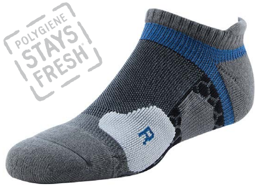
SOCKS FROM TRAVELER, URBAN FASHION WEAR FROM TAIWAN, STAY FRESH.