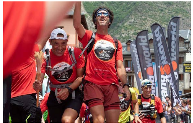
GRAN TRAIL TRANGOWORLD RUNNERS IN RACE T-SHIRTS WITH POLYGIENE.