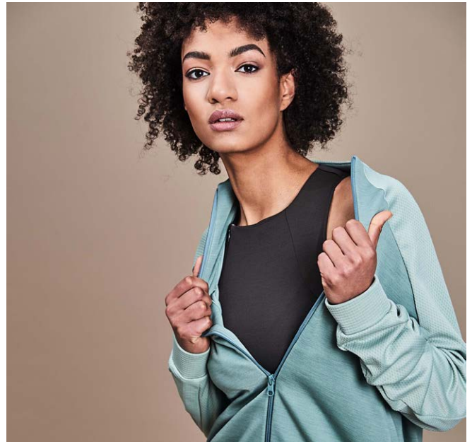
ARYS SCULPTURED TRACK JACKET STAYS FRESH SO USERS CAN WASH LESS.