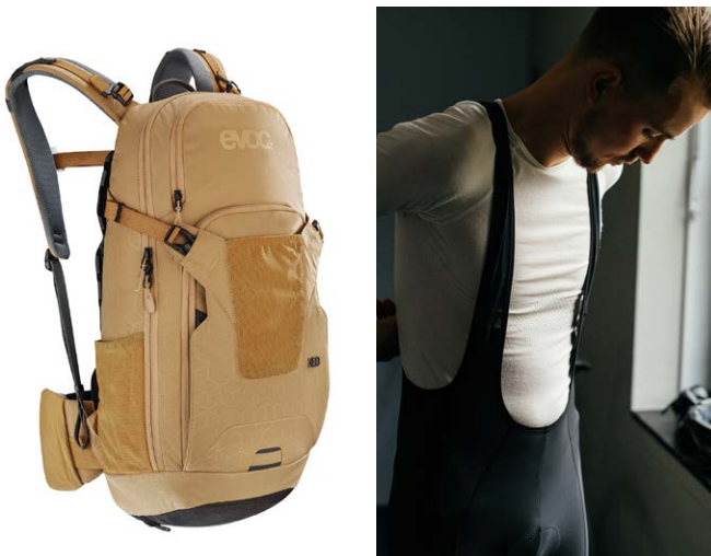
AWARD-WINNING PROTECTOR BACKPACK FROM EVOC AND BASELAYER FROM AGU, BOTH WITH POLYGIENE STAYS FRESH TECHNOLOGY.