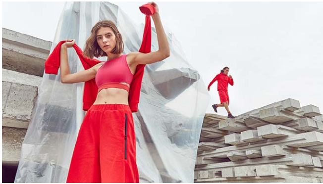
NEW BEIJING STORE FOR HIGH-END DESIGNER SPORTS BRAND, PARTICLE FEVER.